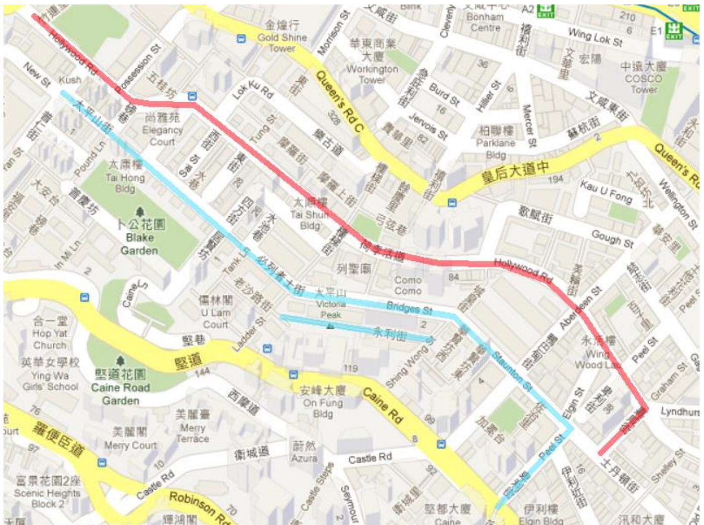
(This is Google Map.)

Central Police Station Compound (Declared Monument), Police Officers Quarters, Man Mo Temple Compound (Declared Monument), Tam Kwok Kwong Shoes at 190-194 Hollywood Road, Wing Wo Grocery, Graham Street Wet Market, Lin Heung Tea House, Dai pai dong, Original Site of Tai Tat Tei/ Hollywood Road Park