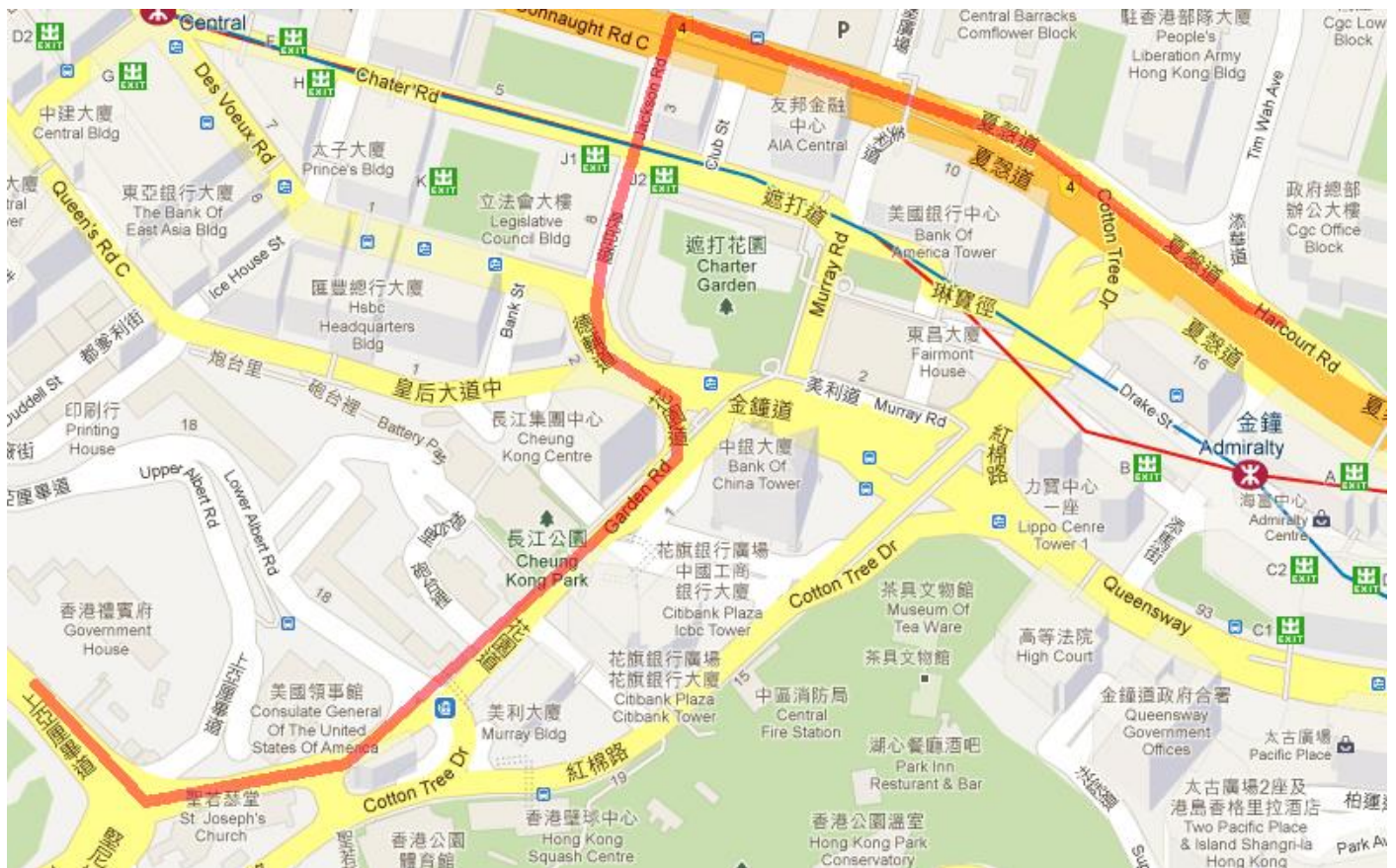
(This is Google Map.)

Government House, Consulate General of the United States of America, Murray Building, Citibank Plaza, Citibank Tower, Icbc Tower, Cheung Kong Center, Bank of China Tower, HSBC Limited Head Office, City Hall, IFC, Statue Square, LegCo Building, Victor Monument (中環遮打花園英雄紀念碑), Tamar Park, New Central Government Offices